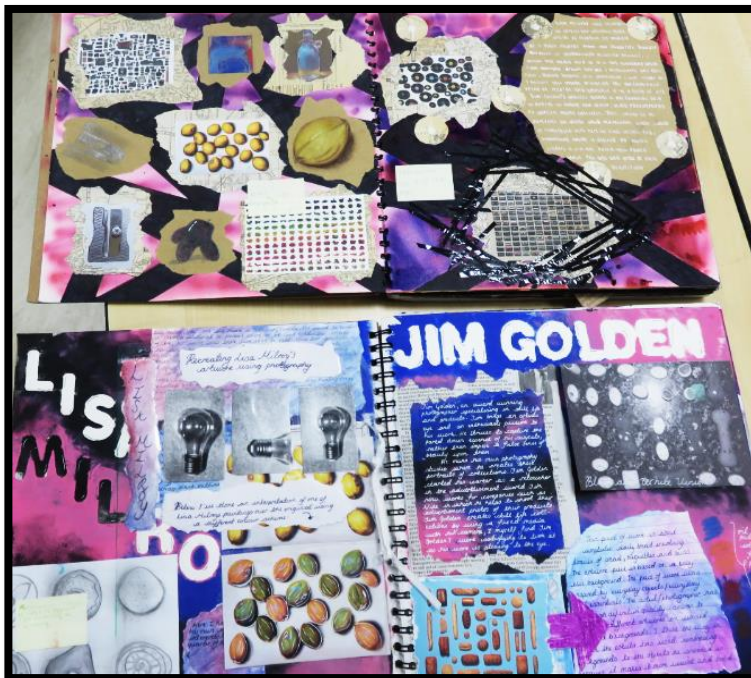
Student Example of their Summer Project – 2019

https://www.youtube.com/watch?v=icq8V2Zc1kM&list=PLstoxBozGUWG9NcoAxlFxlPI_VT6CWmF0