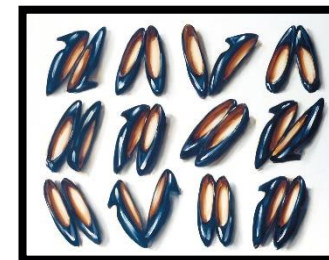
Lisa Milroy, Shoes, 1985

Research and print out images of everyday objects under the following categories: Drawings of everyday objects / Photographs of everyday objects / Paintings of everyday objects / Sewing and everyday objects