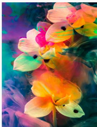
The Rainbow Connection

Choose 12 of your favourite images from the Nocturnal visions or Fleur De Sel and collage them together using www.photocollage.com/ . Add this collage to your 2 nd slide on your A3 PowerPoint sheet.